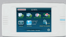
Two-Way Talking Touch Screen