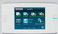
Two-Way Talking Touch Screen