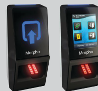
Biometric Fingerprint Scanner