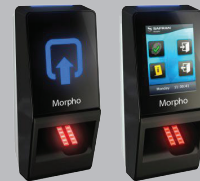
Biometric Fingerprint Scanner